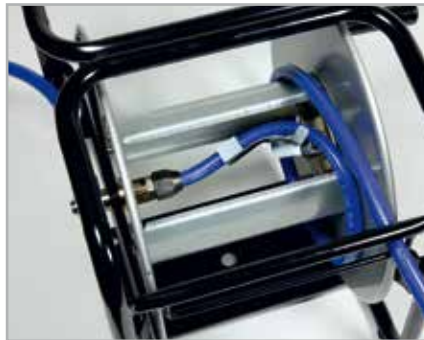
Kink protection to ensure full-flow at any time