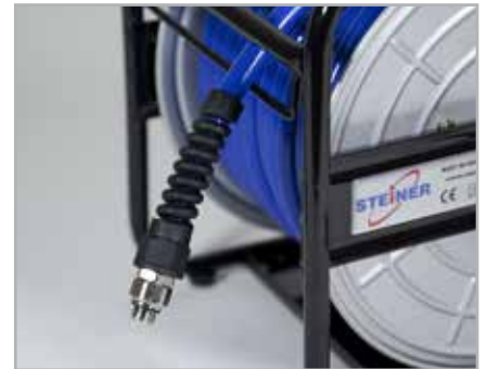
Ball-bearing swivel for best ergonomics