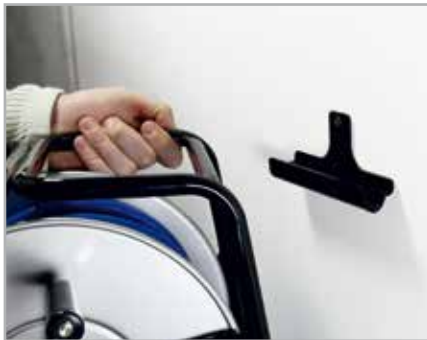
Wall detach system for service car placement